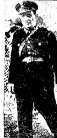
This Central Press photograph, passed by Polish and British censors, shows Warsaw police leading a boy, blinded by the explosion of an air bomb, through the streets of the beleaguered Polish capital.

The gray waters of the sea—submarines—since saved proved the waterways of the world and their chief prey, British ocean commerce, is beginning to feel the effects of their devastation. Following the sinking of the passenger steamer, Athens, off the Hebrides, British freighter and the aircraft carrier Courageous have been struck and sent to the bottom. Above are various views of the new German U-boat fleet. The Central Press map, above, shows where the first victims of submarine warfare went down.