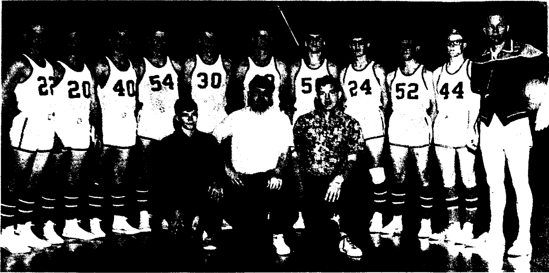
This is Sumner High School's 16-player basketball squad, which will open the season Friday night at Tripoli. Left