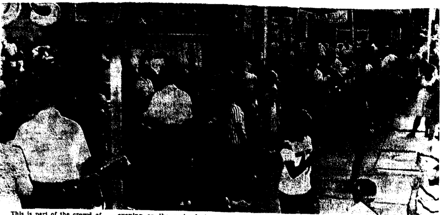
This is part of the crowd of an estimated 1500 persons who were served pancakes and sausages during the annual feed held Thursday afternoon and